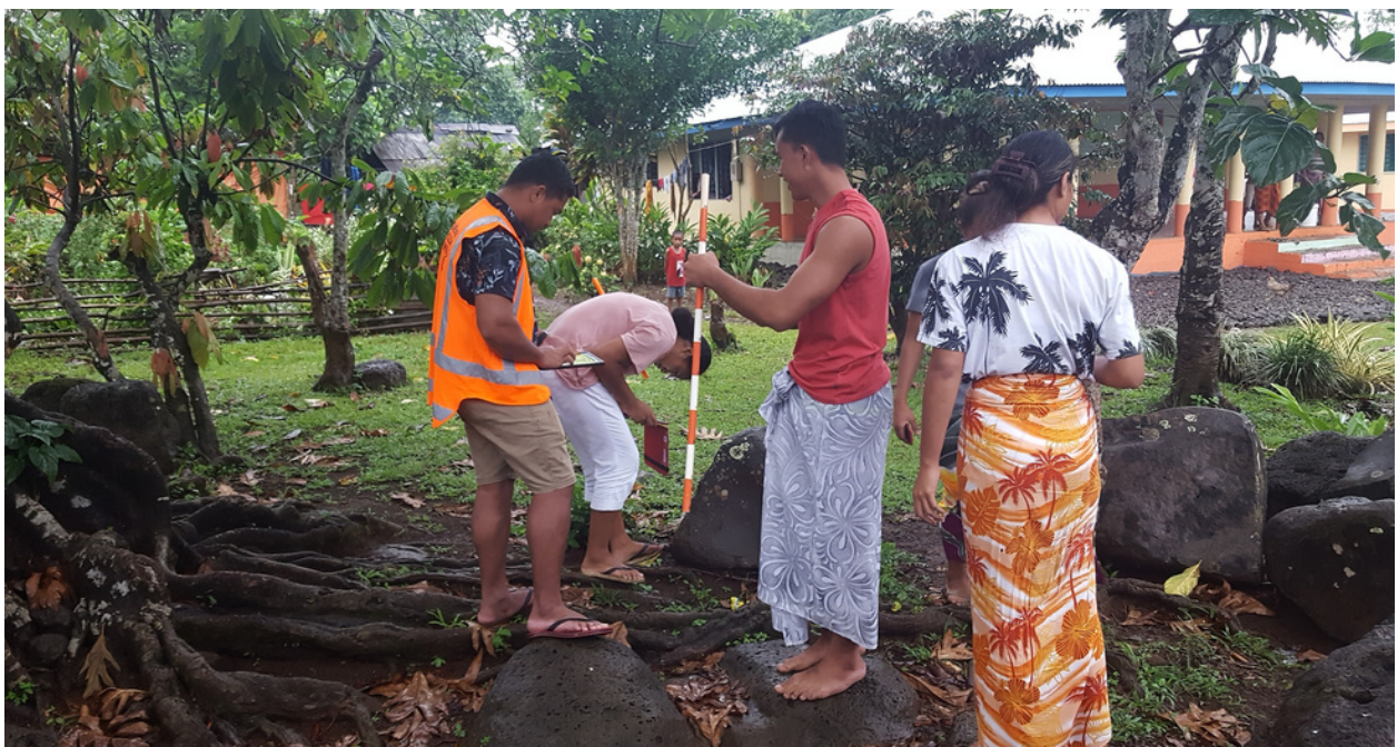
East site of the village road, foaga 3 founded and documented by Foaga Files Team