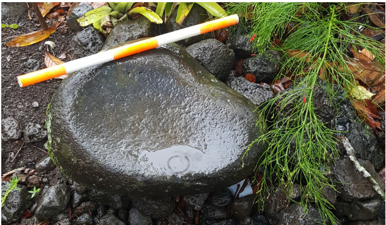
Near shot foaga 5 with photoscale. As mentioned by the old women, (NAME) this foaga were used by the matai to make the ava drinking for the village meeting.