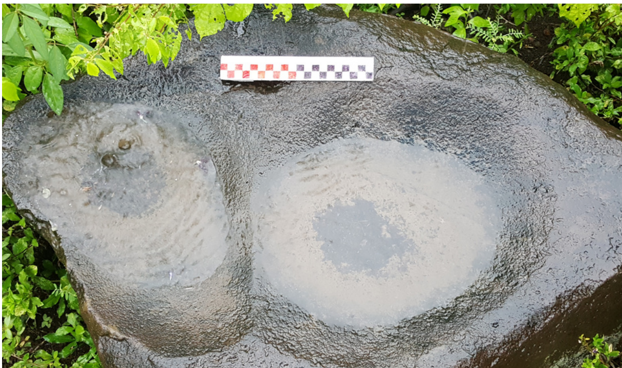
Near shot, foaga 4 with scale on top. Seems like the west end was broken. Water remain on the grinding surface. This foaga may have used for special ceremony.